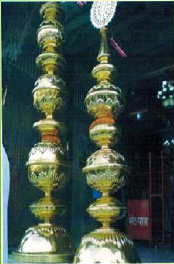
Two magnificent pieces of gold-kalash recently placed on the Shikhar (spire)